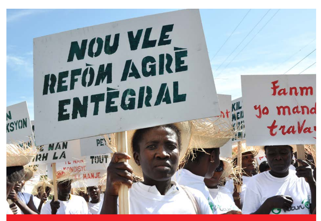
Marchers demand agrarian reform during a march organised in downtown Port-au-Prince, Haiti, by the Je Nan Je platform, a national coalition of farmer organisations and civil society organisations. The march was organised two years after the devastating earthquake of January 2010 to deliver a charter of demands from rural communities around the country to the Haitian parliament. The charter calls for the implementation of redistributive land reform and for provision of decent homes for those affected by the earthquake.

In addition, governments are advised by the TGs to consider pursuing redistributive land reforms to ensure equitable access to land and inclusive rural development. Before any land is allocated to large-scale investors, governments should carry out assessments of the needs of landless groups. They should then consider options to answer those needs – such as allocation of public land, voluntary and market-based mechanisms as well as expropriation of private land, fisheries or forests. Intended beneficiaries include women, families seeking home gardens, informal settlement residents, displaced pastoralists, historically disadvantaged groups, marginalised groups, young people, indigenous peoples, gatherers and small-scale food producers.