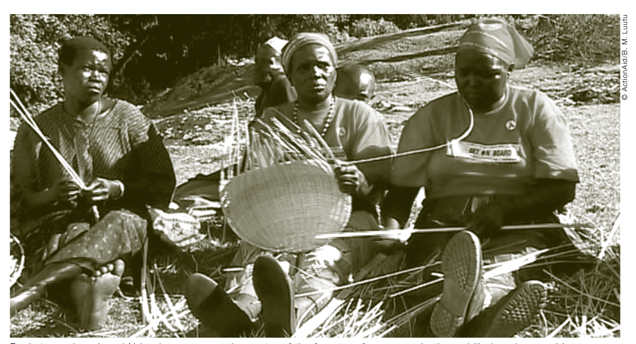
Basket weaving placed Ndorobo women at the centre of the forest craft economy both as skilled workers and barterers of the products with the food grown by the lowland (Sabiny) communities.

It is therefore pertinent to probe AAU and ULA's interpretation of the Consent Judgement as a victory for marginal and indigenous groups in the Ugandan context. Who won? And who lost? What new ground has the Consent Judgement actually broken and for whom? What was ActionAid's specific impact? What does the judgement promise for similar struggles elsewhere? In rights struggles, whose definition of the terms of legal struggle really counts? Is it the lawyers', the civil society organisations' (CSOs) or the community's? If the legal struggle were fought on a different basis - that of indigenous land rights - and not a technical-legal perspective, what would be the prospects of a victory such as this?