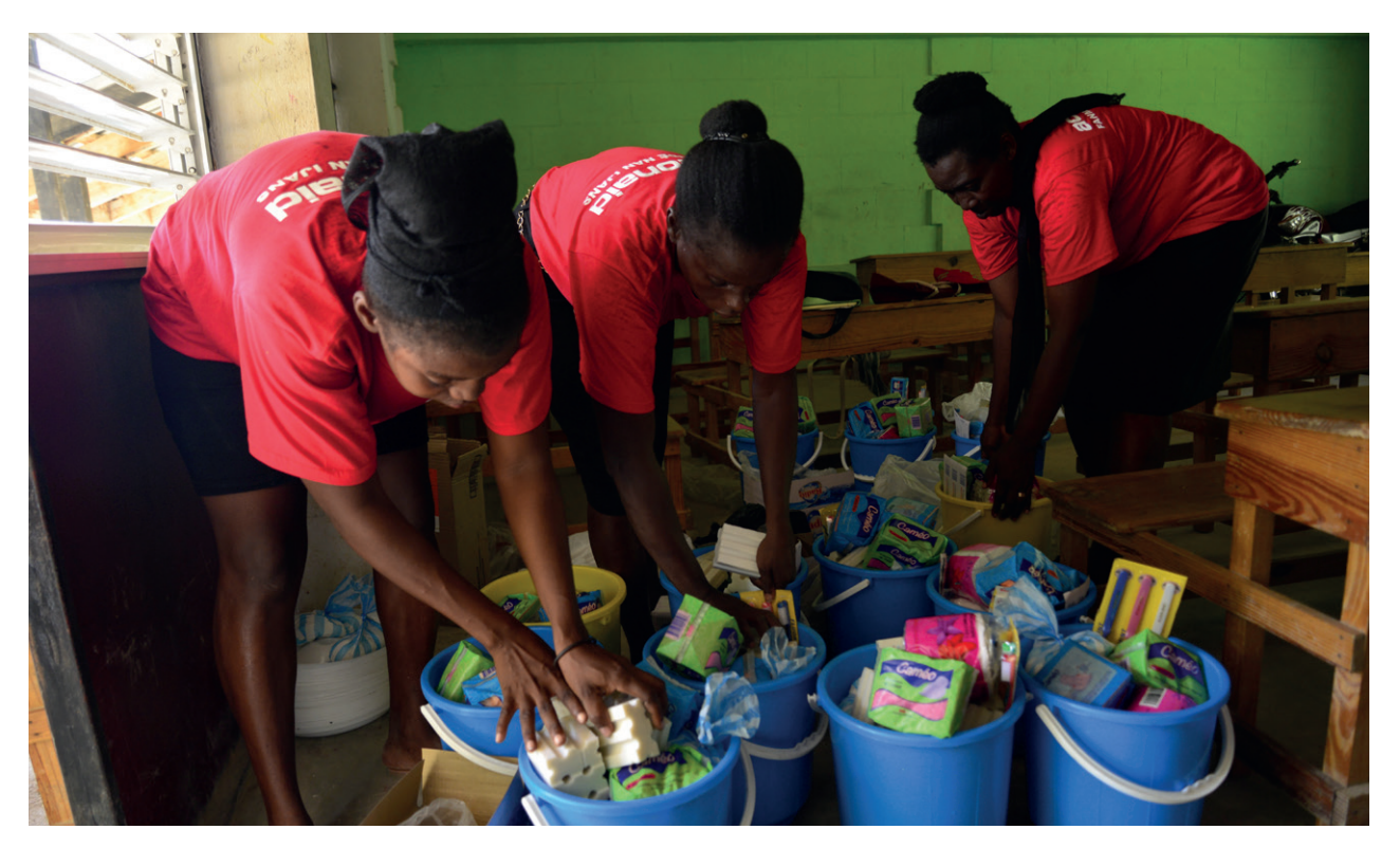
A group of women first responders preparing dignity kits in response to the 7.2 magnitude Earthquake in Haiti (2021, (Fabienne Douce/ActionAid)