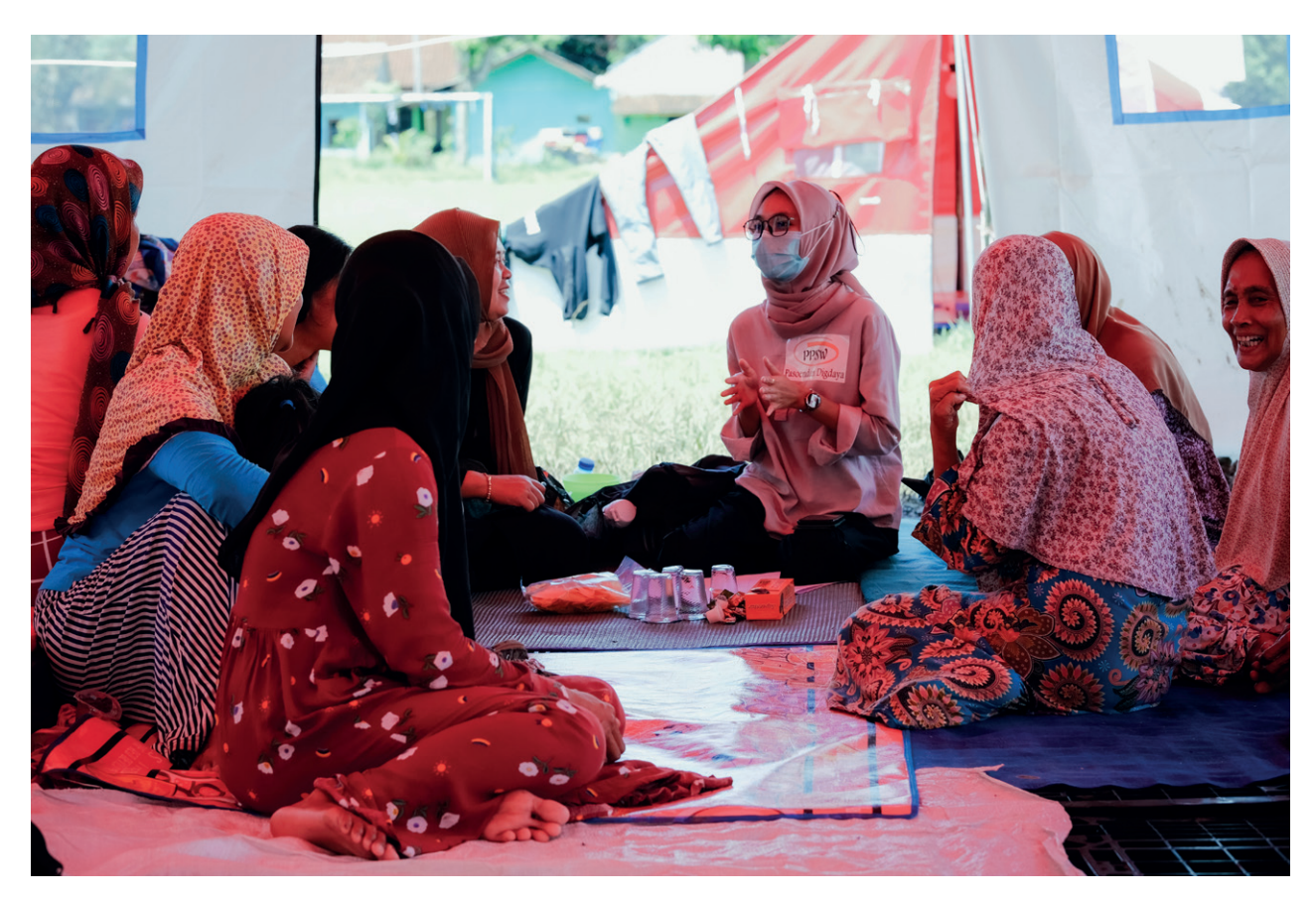
Woman leader conducting a Rapid Gender Assesment for ActionAid's 2022 earthquake response in West Java, Indonesia.