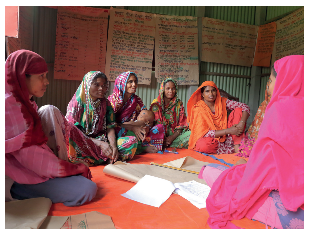
A meeting of women leaders in Gaibandha, Bangladesh, trained on emergency response by ActionAid.

Over the years, there has been little mention of the specific needs of women and girls, gender equality and women's leadership in emergencies. Commitments around GEEWG, including quality reporting on outcomes related to the meaningful engagement of women and girls in humanitarian leadership and programming have not been achieved. This is in part because GEEWG does not feature as an enabling priority and is therefore often excluded from humanitarian programming.