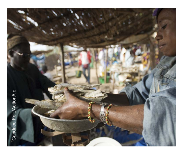
Women who play a vital role in feeding the family through sales of fish at the markets are the hardest hit by over-fishing.

The EPAs could thereby increase the pressure on fish stocks and result in less opportunity for the local industry to process fish, since European boats prefer to ship it directly to Europe. In this case there is likely to be a wave of company closures and a steep drop in income for female employees, job losses in the processing industries as well as a fall in traditional processing activities due to a lack of raw materials. The EPAs would thereby place the food security of hundreds of thousands of women who live off fishing at risk.