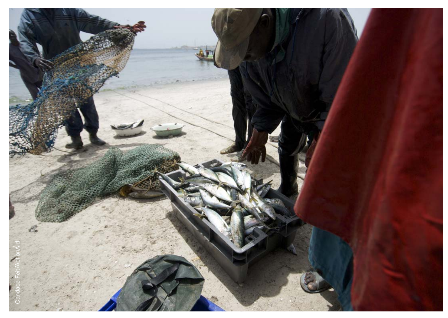
Traditional fishermen unloading their catch at Dakar's Hahn beach have been sorely hit by the over-exploitation of maritime resources.

With regard to the export of fresh or frozen fish, both purchasing power and food habits are key limiting factors for development potentials within the subregion. So, while European markets will remain important for higher value species such as shrimps, sole and octopus, there is a potential to increase exports to emerging economies in Africa, such as Tunisia, Egypt and South Africa. ROYAL PECHE is already exporting to Tunisia and South Africa. Other joint ventures operating in the processing industries are trying to follow suite.