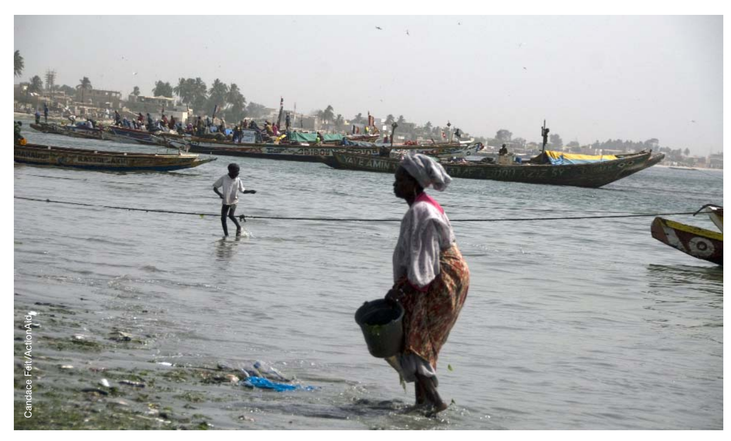
Women are the key actors in the Senegalese fishing industry. Here a woman is unloading fish at the beach in Hahn, one of the main fishing ports supplying Dakar.